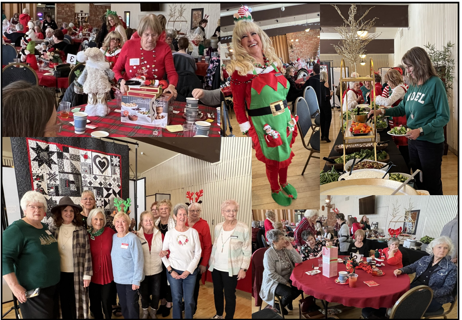
Photos from Christmas Charities Luncheon, December 11