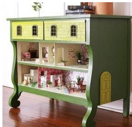
Miniatures come in many creative forms. Come to The Little Group to get involved.