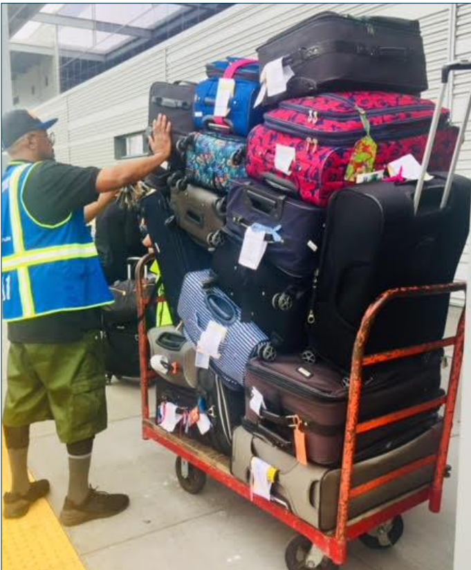
This isn't even all the luggage the cruisers carried on.