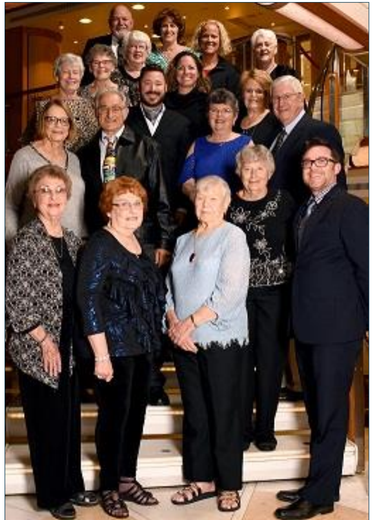
The Cruise Club. 2018.